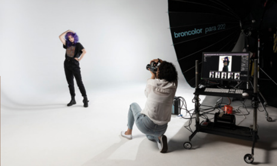
PHOTOGRAPHY CIT REID