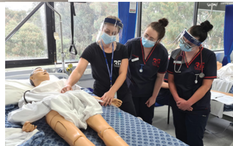
NURSING CIT BRUCE

Our training facilities give students hands-on experience using the latest technology and industry specific approaches to prepare students for employment.