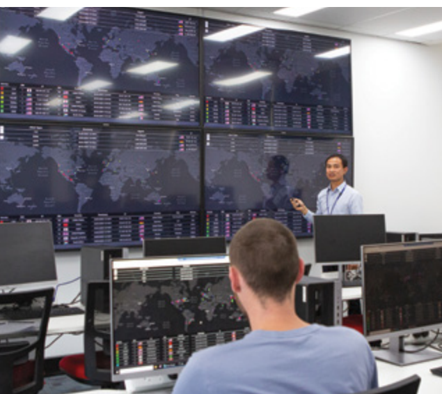
TRAINING SECURITY OPERATIONS CENTRE CIT REID

Our training facilities give students hands-on experience using the latest technology and industry specific approaches to prepare students for employment.