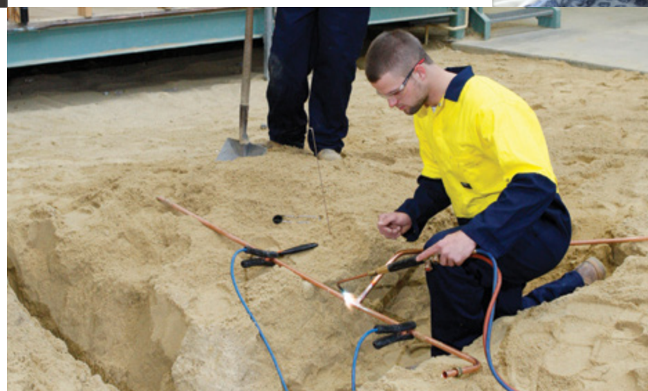
TRADES CIT FYSHWICK