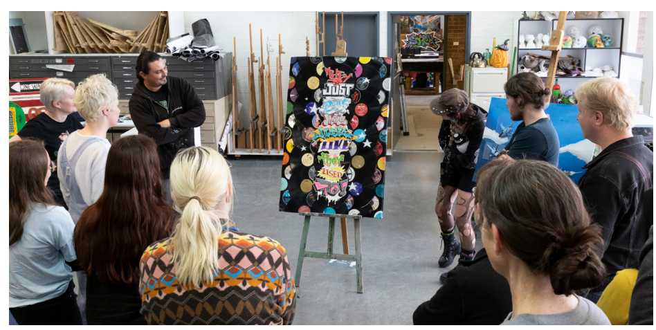
"ART IS AN ADVENTURE INTO AN UNKNOWN WORLD, WHICH CAN BE EXPLORED ONLY BY THOSE WILLING TO TAKE RISKS."